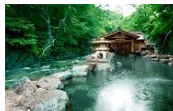
Maya Bath (Woman Bath)