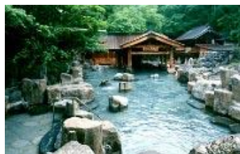
Maka Bath (Both Gender Bath)

It is a hidden hot spa in Gunma, but traffic of people is endless due to television and magazine advertisements.