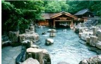
Maka Bath (Both Gender Bath)

It is a hidden hot spa in Gunma, but traffic of people is endless due to television and magazine advertisements.