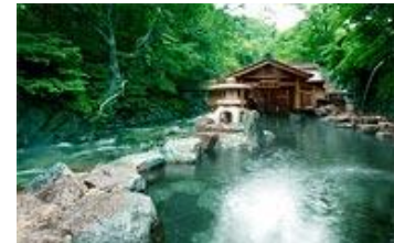
Maya Bath (Woman Bath)